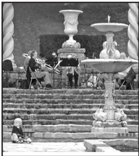
The Verona Columns Concert was a hit with residents of all ages.